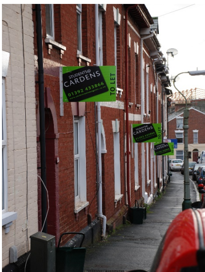
Figure 4: Some Exeter streets are almost entirely houses in multiple occupation