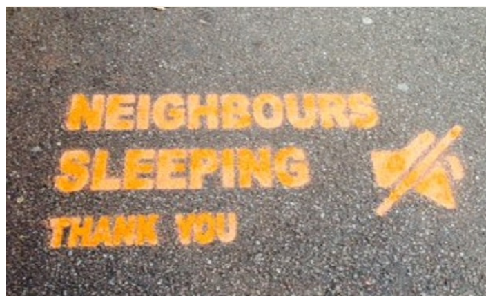
Figure 2: Pavement stencils aimed at students during 2014 Freshers' week

We examined the effects of 'studentification' on one Exeter ward in particular, St James, which has changed dramatically in the last 25 years. According to census